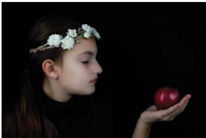
Monika Chuchro, Untitled . Digital photograph, 2019.