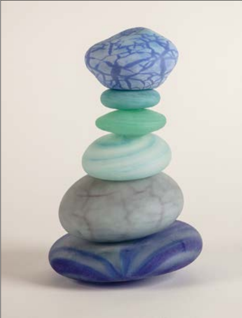
Kevin Chigos-White, Balance in Blue #4 . Glass, 2019.