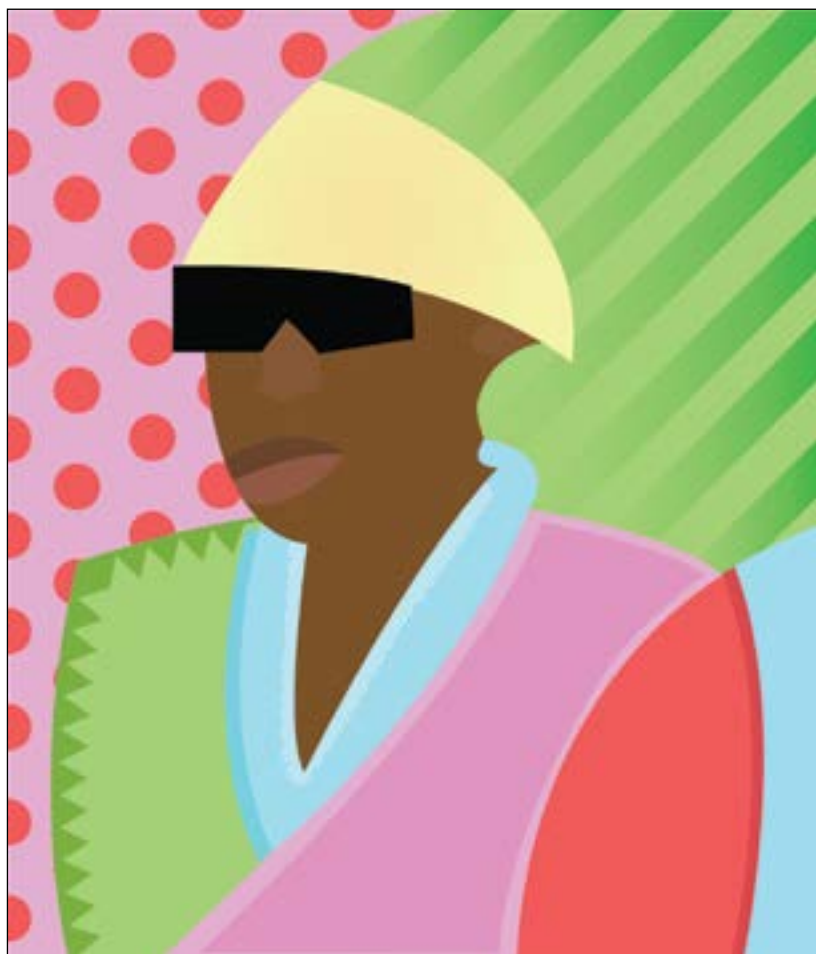
Tristan Cascio, Igor . Digital illustration, 2019.