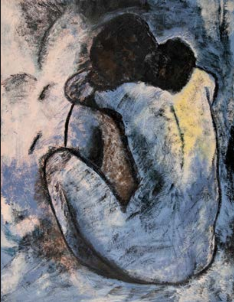
Kirsten Winslow, Untitled . Mixed media, 2019.