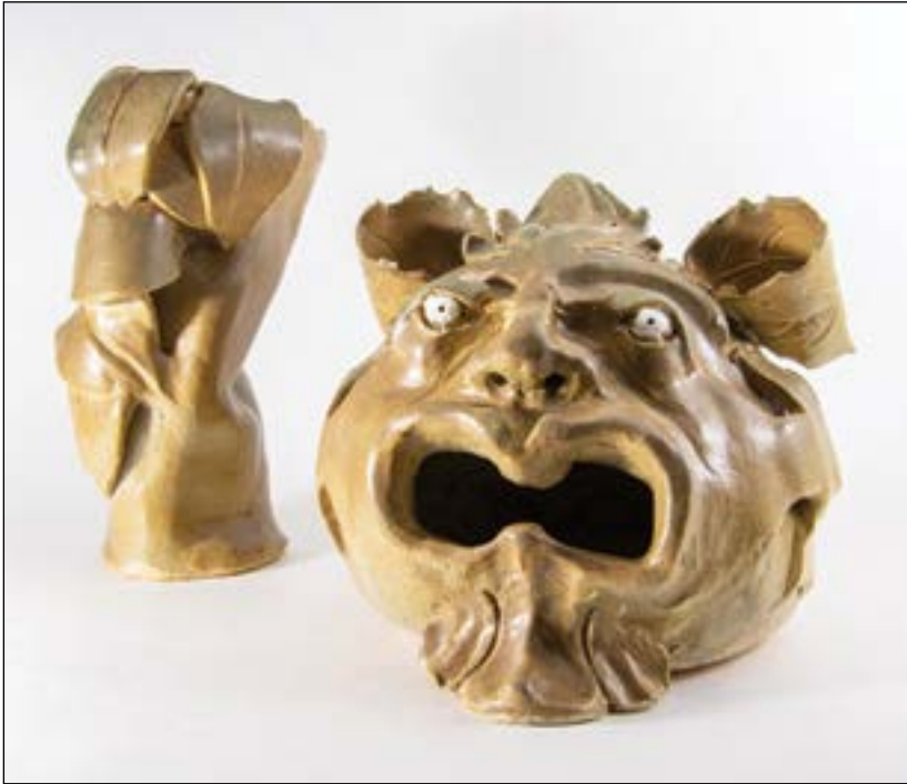
Ellen Bible, Green Man . Clay, 2019.