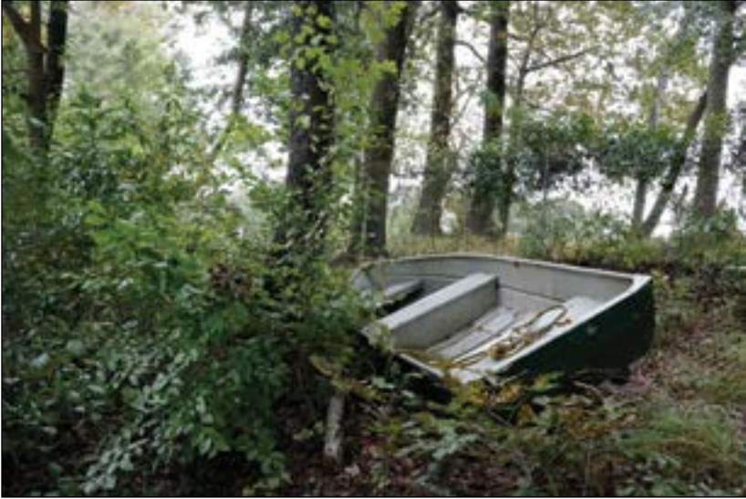
Raymond Moy, Untitled . Digital photograph, 2019.