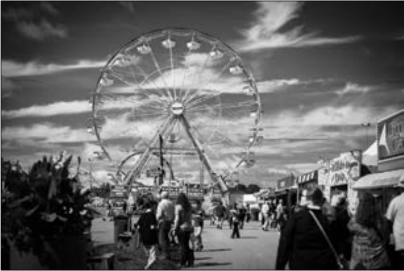
Olga Mendoza, Untitled . Digital photograph, 2019.