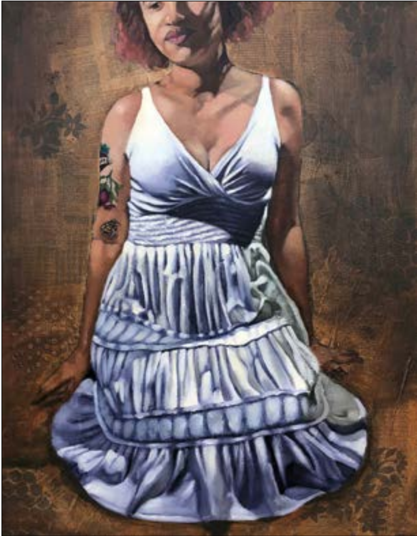
Hope Drew, Girl in White . Mixed media, 2019.