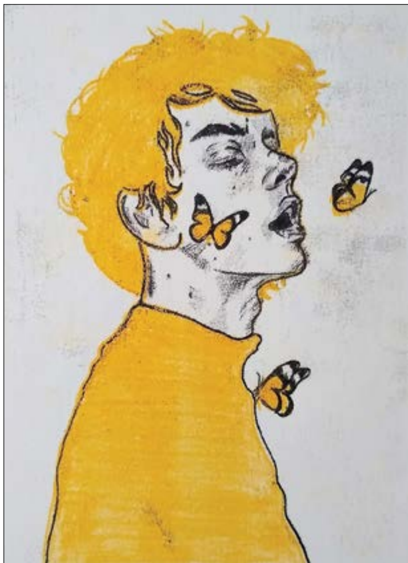
Zorina Amen, Untitled . Monotype, 2019.