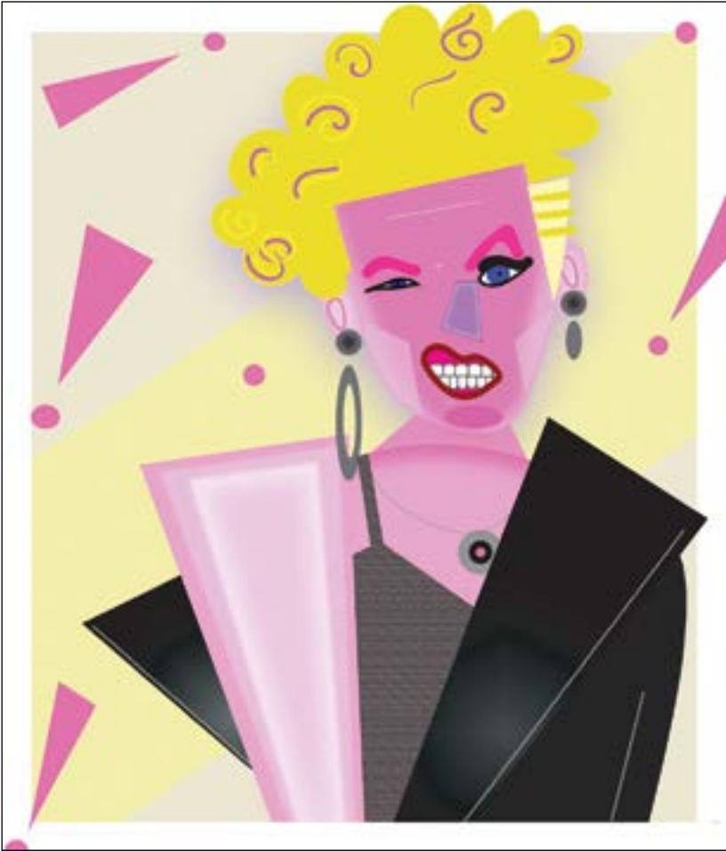
Beverly Chappell, Pink . Digital illustration, 2019.