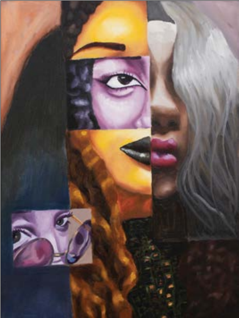
Aaliyah Pettiford, Fragments . Oil on canvas, 2019.