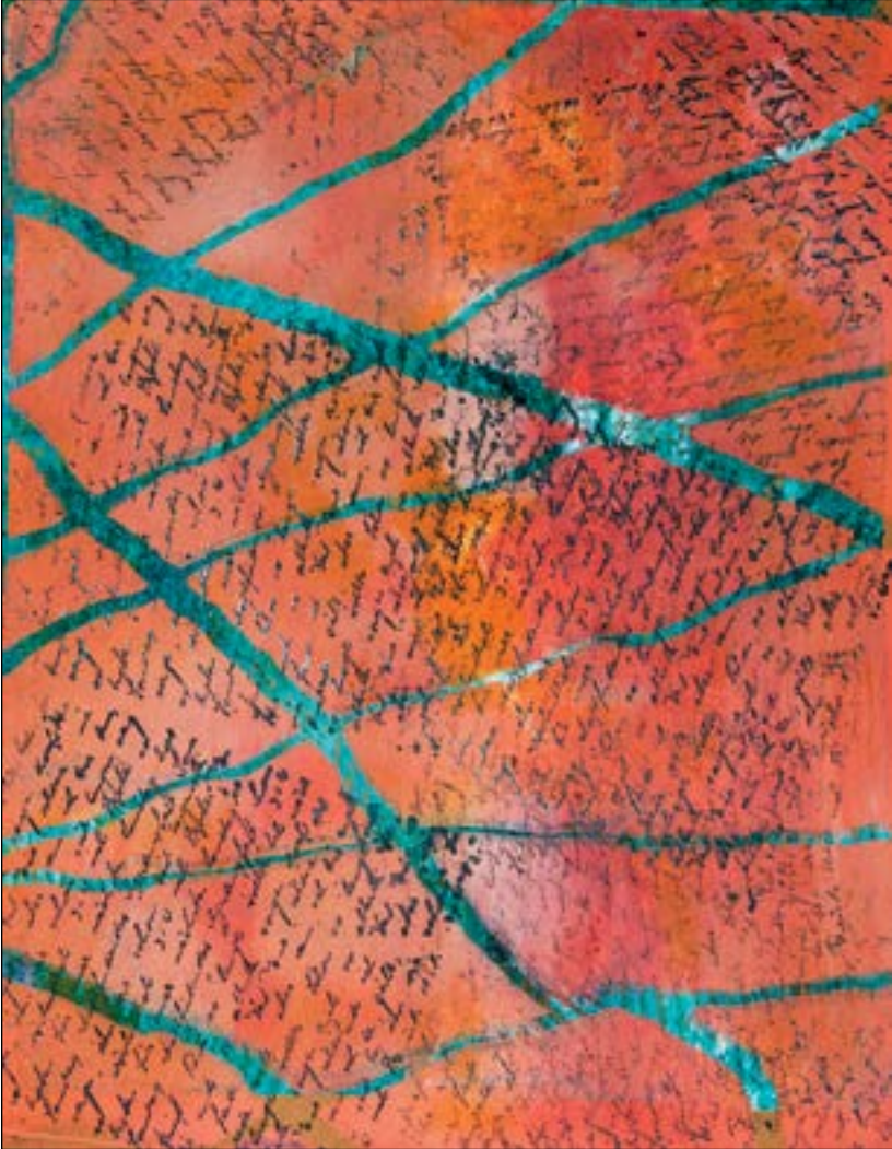
Ty-Yanna Hudgins, Untitled . Mixed media, 2019.